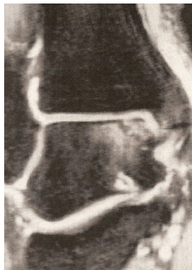
MRI demonstrates talar dome fracture

Generally, the AP ankle view is best for visualizing deep, cup-shaped medial lesions, although the lesions are often appreciated on the mortise view as well. Lateral lesions are best visualized on a mortise view and are generally thin and wafer-shaped. If suggested by the clinical scenario, fractures not visualized with plain radiographs may require magnetic resonance imaging (MRI) or computed tomography (CT).